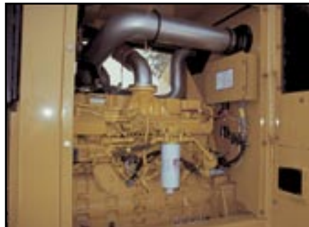
The Tier III engine is separated from the hydraulic components