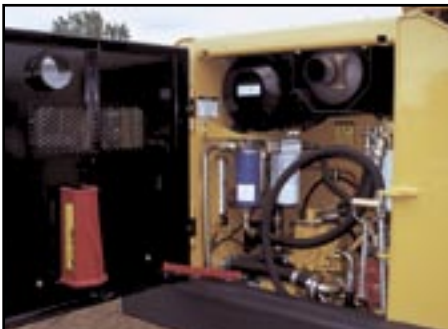
Hydraulic pumps and filters are located in the rear and easily accessed.