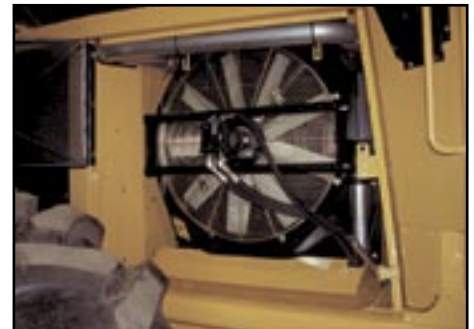
The automatic variable speed fan improves fuel efficiency.